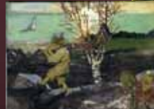
Lori Chilson Collage