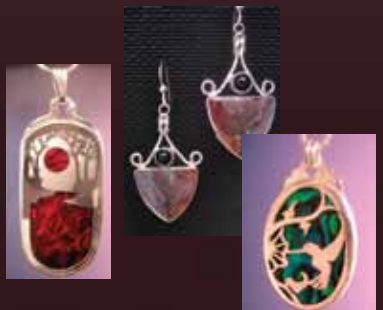
Richard Christianson Jewelry